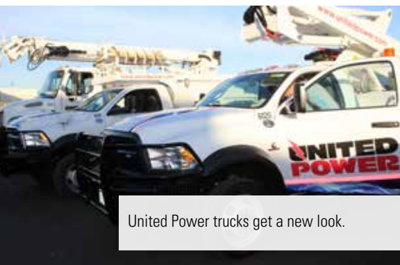
United Power trucks get a new look.