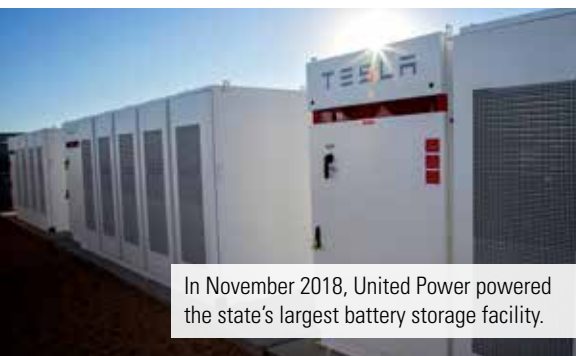
In November 2018, United Power powered the state's largest battery storage facility.

In the years leading up to its 75th anniversary in 2013, United Power experienced unprecedented growth for an electric cooperative, more than doubling in size. The way the cooperative serves its members has changed with the development and advancement of technology available to both provide power for and communicate with its members. This is the final piece in a three part series chronicling the cooperative's history leading up to its 80th Annual Meeting this April.