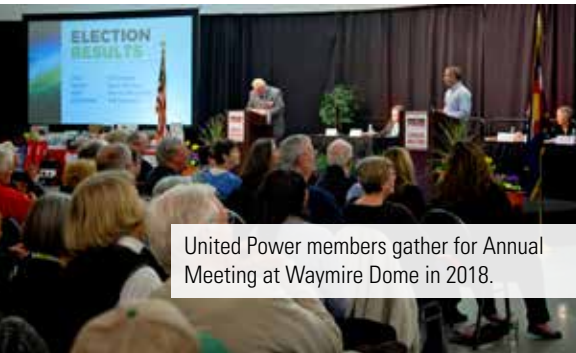
United Power members gather for Annual Meeting at Waymire Dome in 2018.